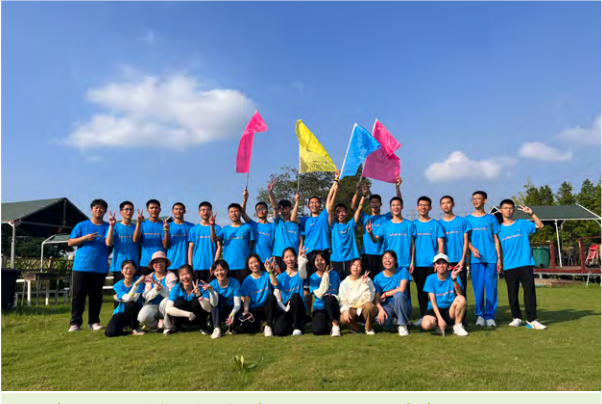
Students participating in the Summer Workshop